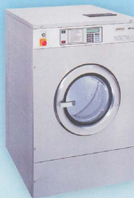
T range - industrial tumble dryers