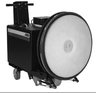
Using the handle, the head can tip 90° from the operating to the pad change position.

Productivity — The Charger 2717 DB covers at least 32,432 sq. ft. per hour, for a total of 97,296 sq. ft. per charge. (Floor coverage figures taken from ISSA 447 Cleaning Times.)