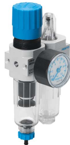
Service unit FRC