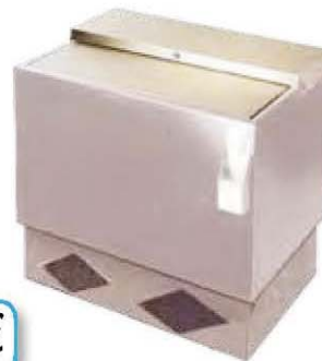
Boottle cooler (18.092.012)