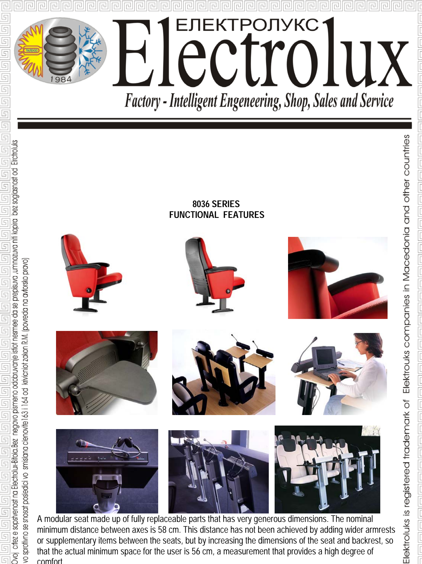
or supplementary items between the seats, but by increasing the dimensions of the seat and backrest, so that the actual minimum space for the user is 56 cm, a measurement that provides a high degree of comfort.

Adresa: ul.Braka Mingovi 18, 7000 Bitola; tel: 047/203-330 ,203 900ul.A.Guslarot.1a 02/329 8 130 Skopje