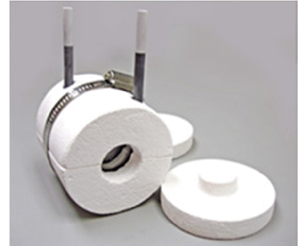
Robust Radiator Part # RHUL-MP1125-3