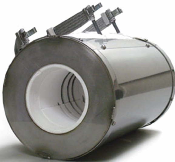
Robust Radiator Part # RHUL-MP3625-14 (with stainless steel casing option)

Custom sizes and higher watt density available