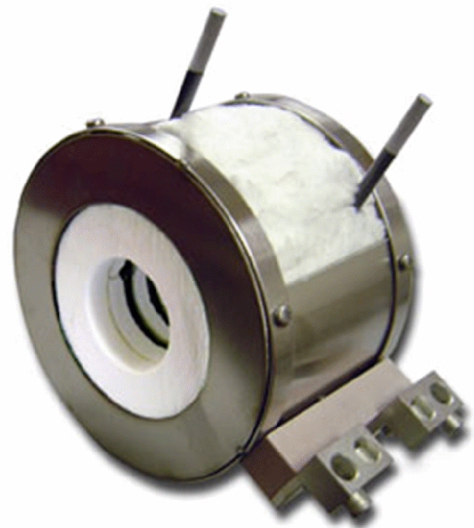
Robust Radiator Part # RHUL-MP2125-4 (with stainless steel casing option)