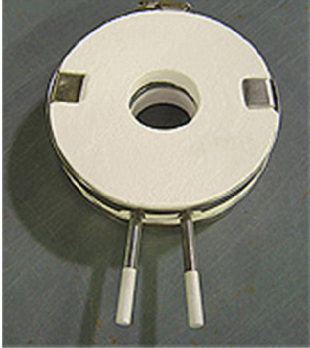
High Temperature Sleeve Heater Part # SLH1.5