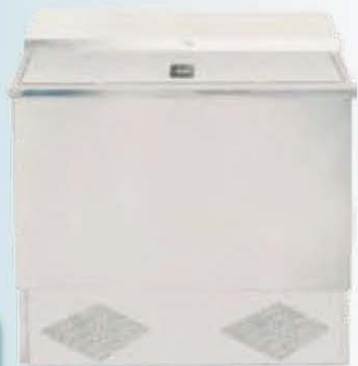
Glass cooler (18.092.011)