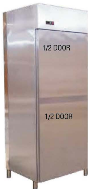
XTHS 1P 2D