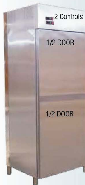
XTHS 1P 2D 2T