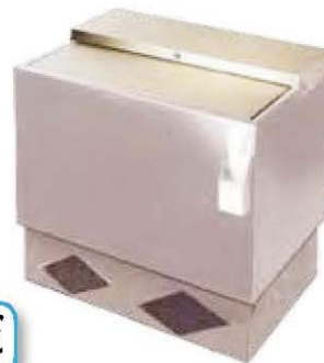
Boottle cooler (18.092.012)