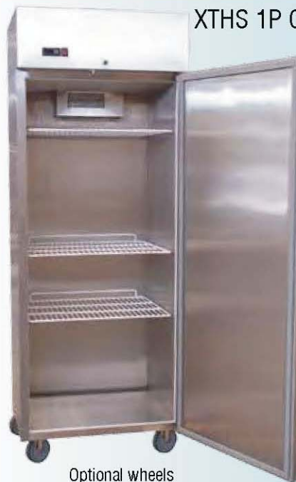
XTHS 1P CLASSIC