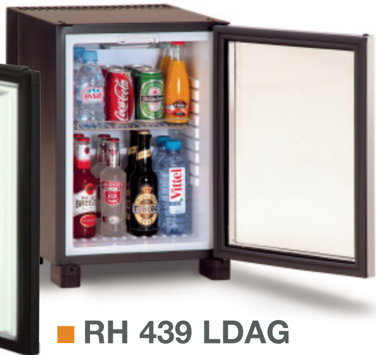
■ RH 439 LDAG 30 litres class