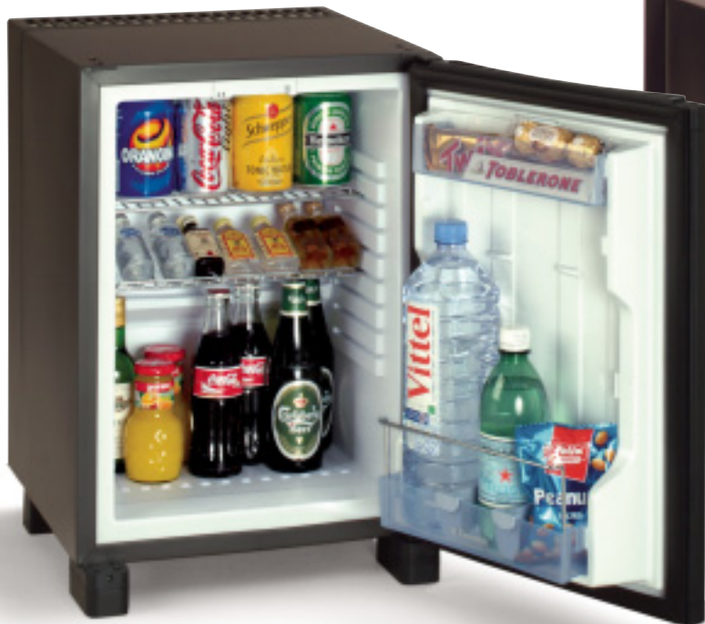
■ RH 439 LD 30 litres class