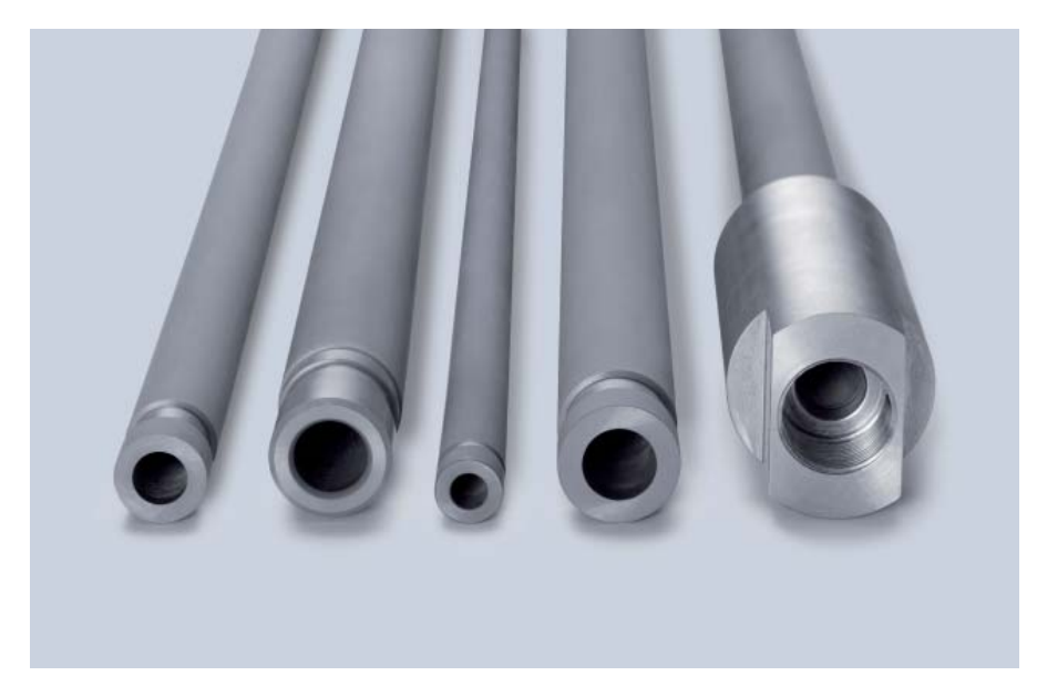
EKatherm® in use measuring the temperature of liquid aluminum

The most efficient material used for temperature measurement and control of many non-ferrous alloys.