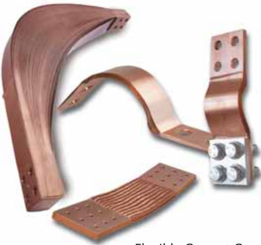
Flexible Current Connectors

Carbon brushes and holders in top quality for long life