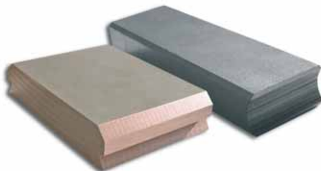
Carbon Current Collector Shoes for Cranes