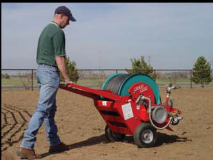
A well balanced machine easy to move into position