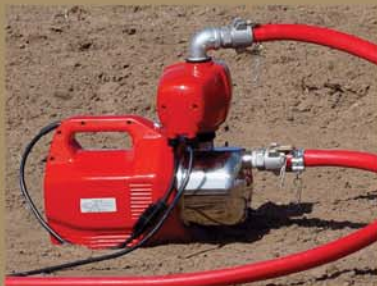
Small electric booster pumps are easy to install at arena

NOTICE: These specifications are for a guide only and are based on theoretical calculations and performance tests. This is to be used as a guide only, as performance may vary under field conditions. The combination of gallons per minute, pressure, and atmospheric conditions such as wind speed will determine your performance characteristics. Shortening the tube length if necessary to fit your arena length can also increase performance of your MICRO RAIN.