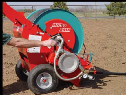
Adjust speed control for desired application