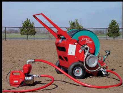
Hook up hose to water and/or booster pump