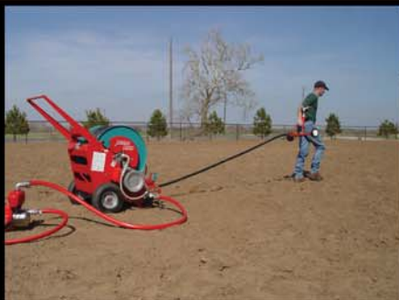
Pull sprinkler cart across arena

* For more detailed performance information review the performance charts on the back of this brochure or consult you KID dealer for help in sizing your MICRO RAIN!!!