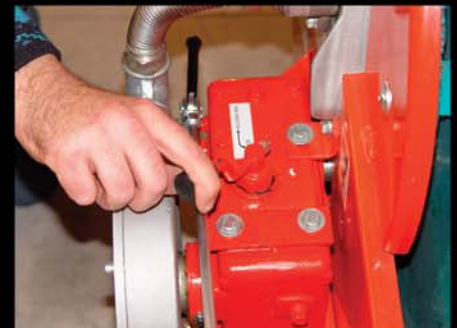
Release gearbox to unroll hose