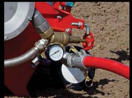
Traveler automatically shuts off at end of watering