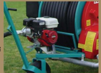
The MR43 and larger may be fitted with an onboard 5HP Honda boost pump

Your water system's capability of producing pressure and gallons per minute can greatly affect the distance of throw of the sprinkler and the amount of time to apply water. There are several options to add booster pumps to your system at the arena site which can greatly enhance the performance of your MICRO RAIN arena sprinkler.