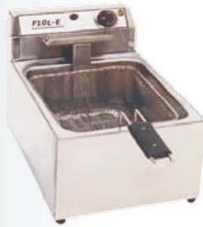
Table top single electric fryer with one removable basin 2/3 and 150 mm deep. Stainless steel construction. Equipped with thermostat 50-200°C and OFF position, pilot lamp, power indication lamp and thermal fuse 230°C. Micro-switch at the head of the unit to cut the power by removing the head. Basket with breakable handle

Operation voltage: 230 VAC/50-60Hz Bucket dimensions: 354*325 mm Power: 3200W Dimensions: 360*330*330mm Capacity: 10 lit.