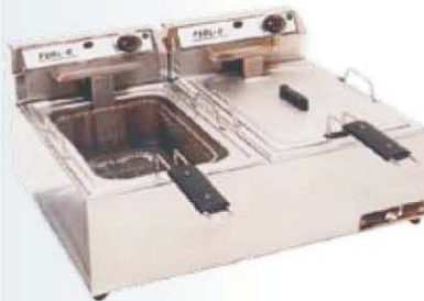
Table top double electric fryer with two removable basin 2/3 and 150 mm deep. Stainless steel construction. Equipped with 2 thermostats 50-200°C and OFF position, pilot lamps, power indication lamps and 2 thermal fuses 230°C. 2 Micro-switch at the head of the unit to cut the power by removing the head. Baskets with breakable handle

Operation voltage: 230 VAC/50-60Hz Power: 2*3200W Bucket dimensions: 354*325mm Dimensions: 630x330x330mm Capacity: 2*10 lit.