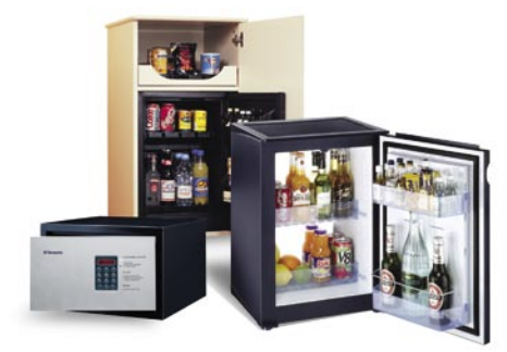
Dometic. Your guarantee for satisfied guests.

Dometic is organised in two business areas, RV and Pleasure Boat Systems and Special Refrigeration Systems. Dometic has production facilities in 10 countries, its own sales and marketing operations in 35 countries plus 65 distributors globally. The 2002 turnover amounted to approximately 700 million Euro, realised with the help of approximately 4,000 employees.