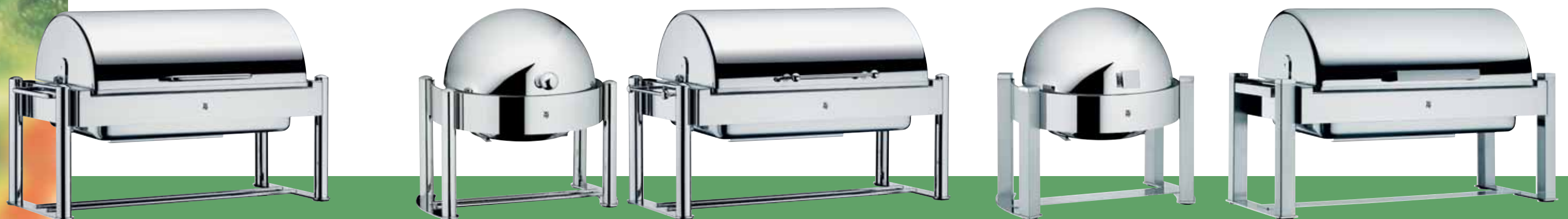
»MANHATTAN« GN 1/1 06 3335 6040