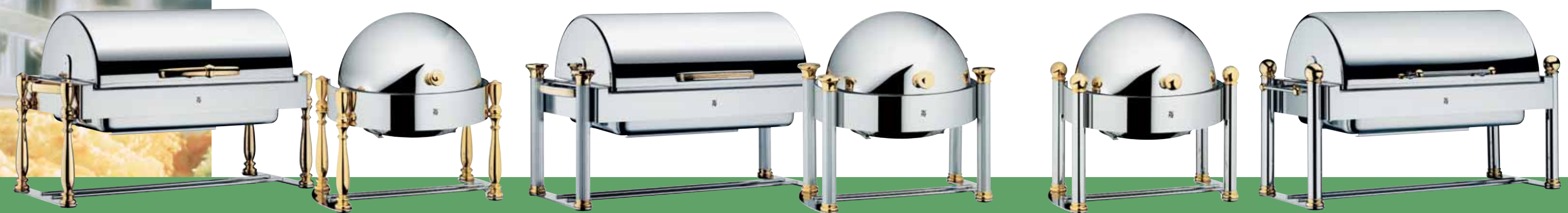
»CLASSIC« GN 1/1 06 3334 6210