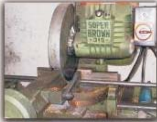
cutting to fix length