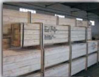
packing in seaworthy wooden cases