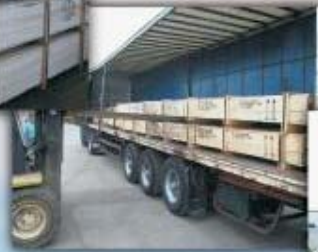
loading on truck