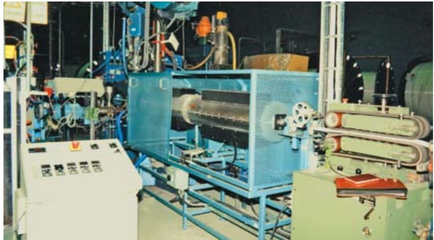
Uponor evalPEX pipes are heated in two SUPERTHAL cassettes before the diffusion barrier is applied.

SUPERTHAL heating modules are available as cylinders, half cylinders and panels in a broad standard range. Several modules are mounted together in a flexible system to permit advanced temperature profiles and control. Kanthal supplies modules or complete cassettes.