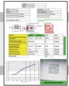
Data Matrix verification report