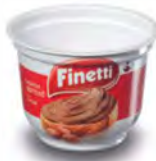
ART Ø 75 SLEEVED Ranging from 115-210ml

packaging solutions open up new creative horizons, offering upmarket decoration alternatives that differentiate your products' identity. From the tried-and-tested 8-colour Offset Printing method for exceptional looks, to the premium Shrink Slewing that adds value to your brands and makes them stand out at the PoS, decoration applications draw the attention of your customers and establish a long-term relationship with them . Especially for lids, both regular and membrane, we also offer the possibility of adhesive labelling that "tops up" your branding potential.