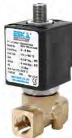
ESV 406 (3/2,N.C)

1: Inlet 2: Outlet (Body) 3: Outlet (Enclosing Tube) De-energised: 1-3 Energised: 1-2