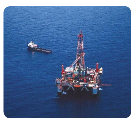
Oil and Gas industry

Some test results of the following materials are reported in this document. These tests were carried out at SKF Economos GmbH in accordance with well known test standards for ED tests for elastomeric materials for the Oil and Gas industry.