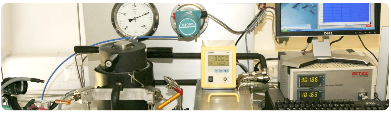
Testing equipment, R & D

Evaluation of the tests has been performed as visual inspection with a rating according to the respective standards. The respective rating systems can be found in Annex 1 to this document.