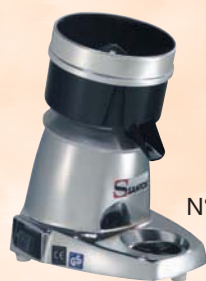
N°11 C Chromed